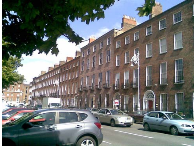
45 Merrion Square, Dublin

Go raibh míle maith agat! to the Irish Architectural Archive (IAA) for hosting the 2009 Summer Conference “Design Quality in Architecture and Urban Design”.